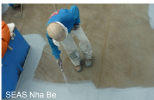
SEAS Nha Be