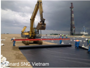
Menard SNC Vietnam