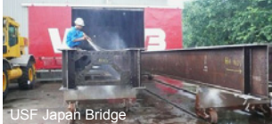
USF Japan Bridge