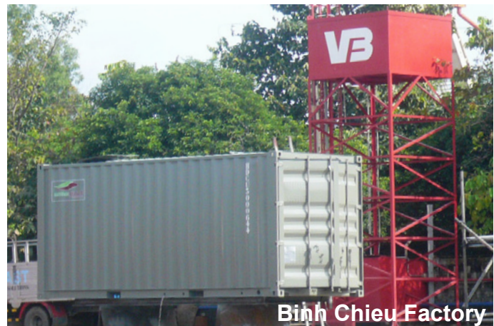
Binh Chieu Factory

■ At Vivablast Workshop in Ho Chi Minh City, our professional blasting, coating, fabrication and anti-corrosion services have been delivered for the 20ft Waste Water Treatment Container Project for COMMON GROUND RESOURCES, INC . This container will be exported to the USA and demand Vivablast's intensive resources to meet deadlines and quality standard set. Vivablast proudly delivered best results for this new Client.