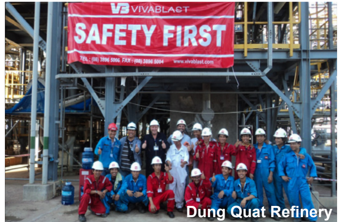
Dung Quat Refinery

■ Vivablast has executed 1,700 m 2 of TSA - Thermal Spray Aluminum coating works for the Flare Boom Topside Moc Tinh (Bien Dong 1 Project), as Subcontractor of Vietsovetro Company at their Vung Tau Workshop. Vivablast applies specification BD-00-M-S-0331 - Coating System BD11 and with our best cooperation with Vietsovetro Team have enabled Vivablast to perform high-productivity as per the Project planning and load-out schedule.