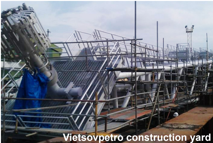
Vietsovetro construction yard

■ Vivablast has executed 1,700 m 2 of TSA - Thermal Spray Aluminum coating works for the Flare Boom Topside Moc Tinh (Bien Dong 1 Project), as Subcontractor of Vietsovetro Company at their Vung Tau Workshop. Vivablast applies specification BD-00-M-S-0331 - Coating System BD11 and with our best cooperation with Vietsovetro Team have enabled Vivablast to perform high-productivity as per the Project planning and load-out schedule.